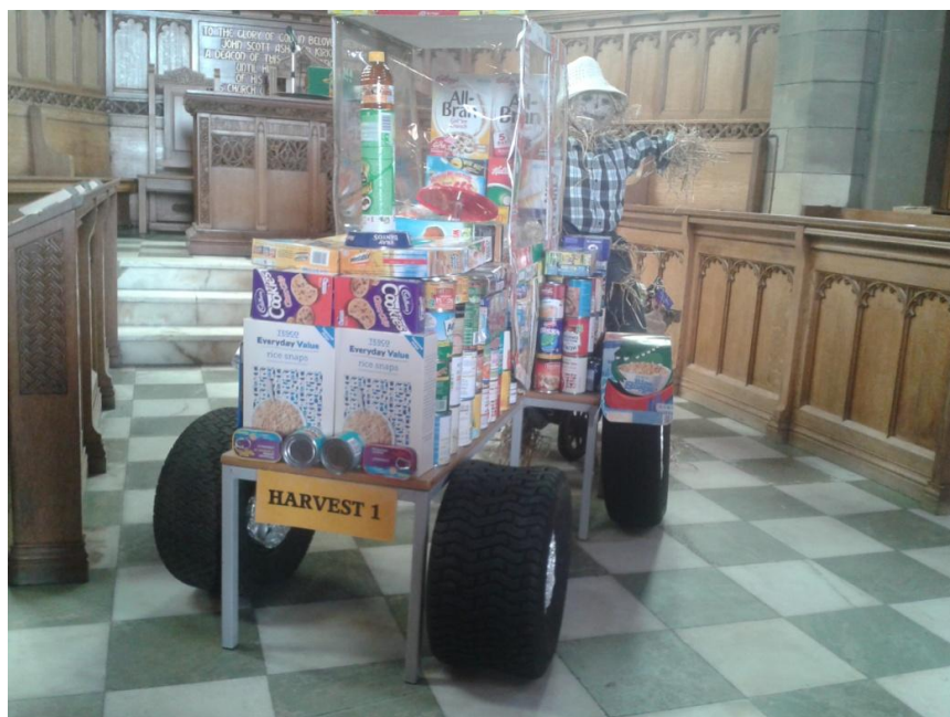
. . . and the completed model – complete with scarecrow driver!