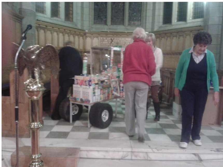
The 'Harvest Tractor' under construction . . .