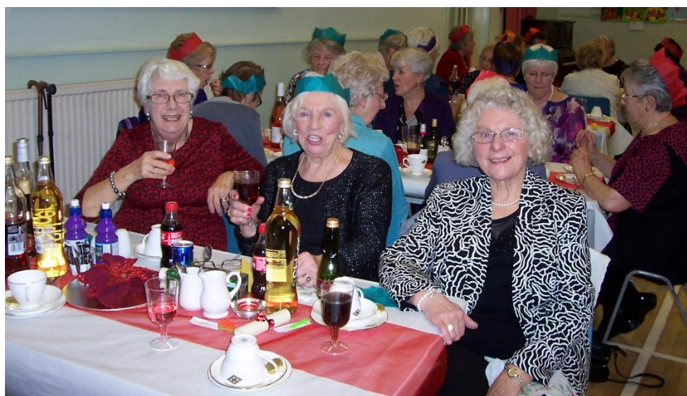
The Guild Christmas Party - 2013