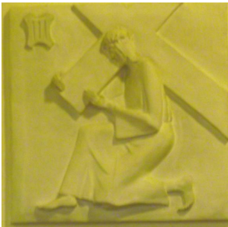
Tuesday – Stations of the Cross - St Dominics