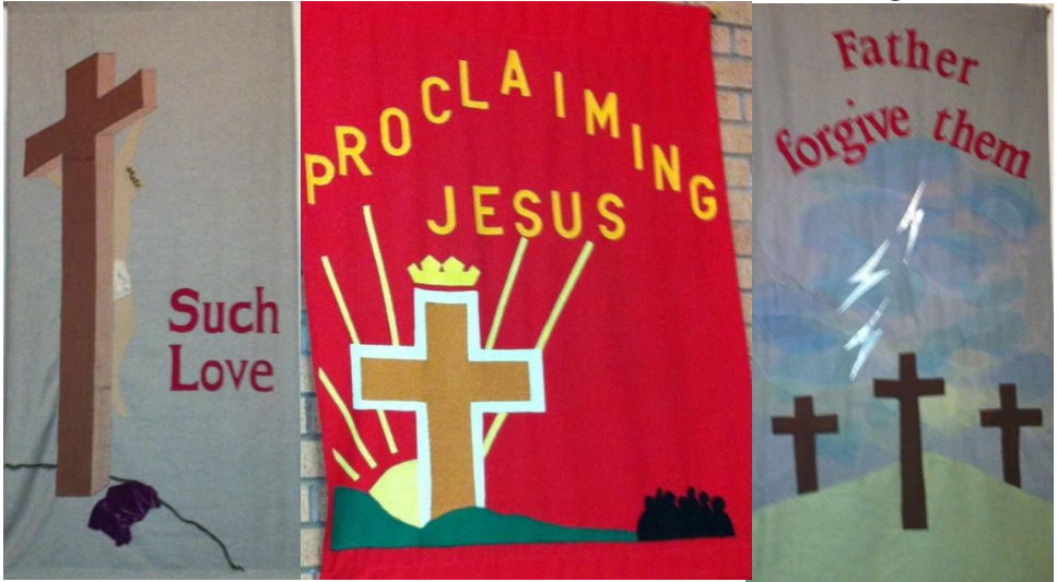
Wednesday – Kenmure Church