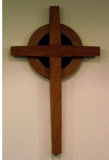
Monday – Robroyston Church