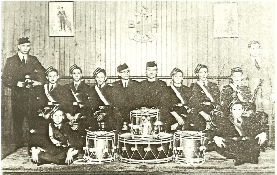
1936 FIRST COMPANY BAND