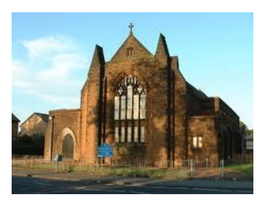
Colston Wellpark Church

residents for a short Service lasting about 20 minutes or so. The Service is held in the Lounge.