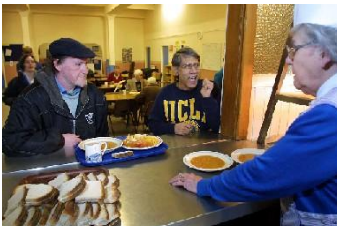
Seen here – some guests at the mission receiving hospitality and a warming bowl of soup