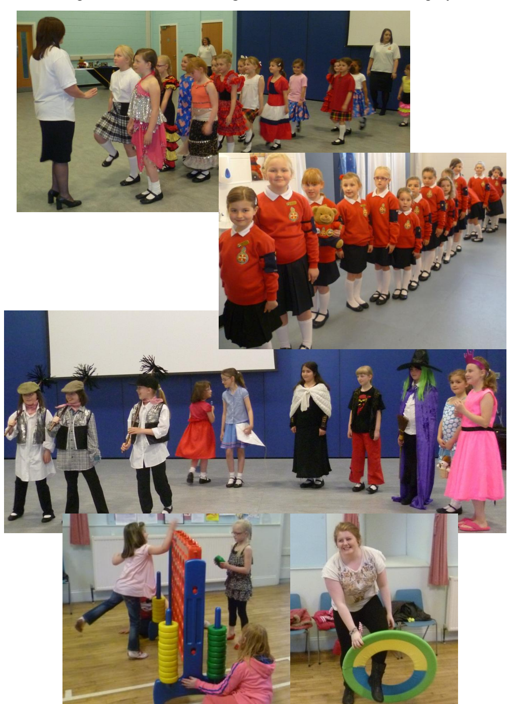
GB - Explorers Some pictures from our fun night... Some Juniors at the display...