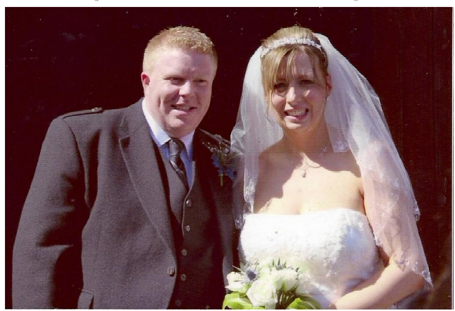
Which took place at St Mary's Church in Kirkintilloch on Saturday 10th May