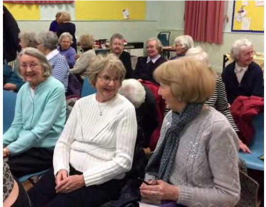
Gathering for the start of the meeting!

Unfortunately, our Speaker for 8 th January was unable to come due to unforeseen circumstances close to the date, always a problem for any Convener! However, one of our own church members volunteered to step up to the plate and take over the entertainment for that evening. He wouldn't let us take a photograph, but I am sure you all know