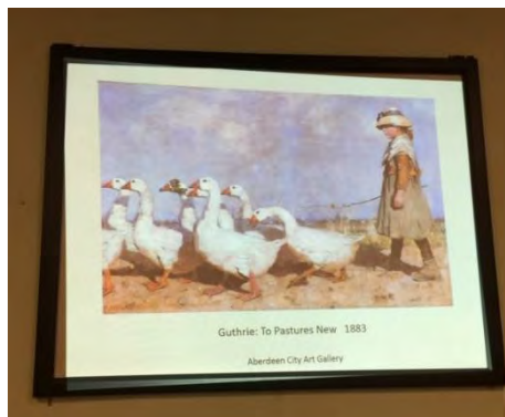
A beautiful painting of the period