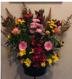
Floral arrangement from Church Harvest Service