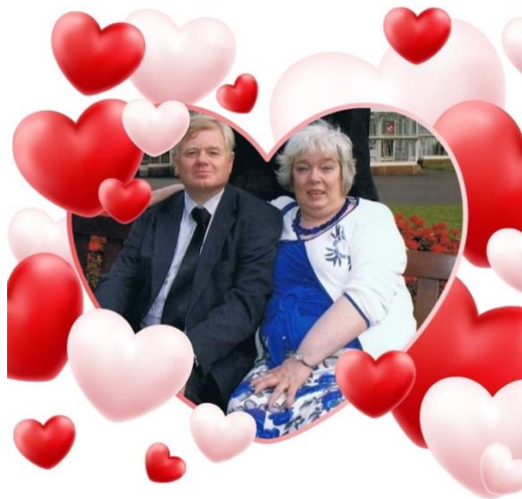
RUBY WEDDING ANNIVERSARY