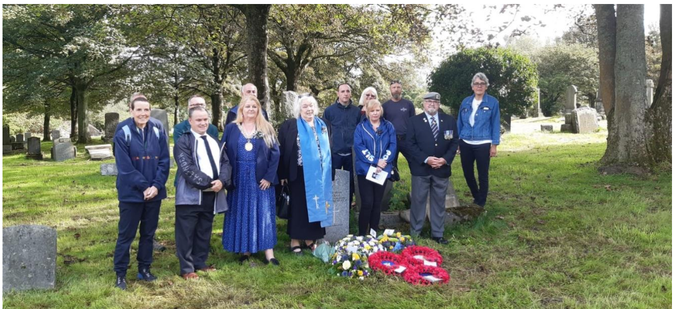
Photographs of the ceremony