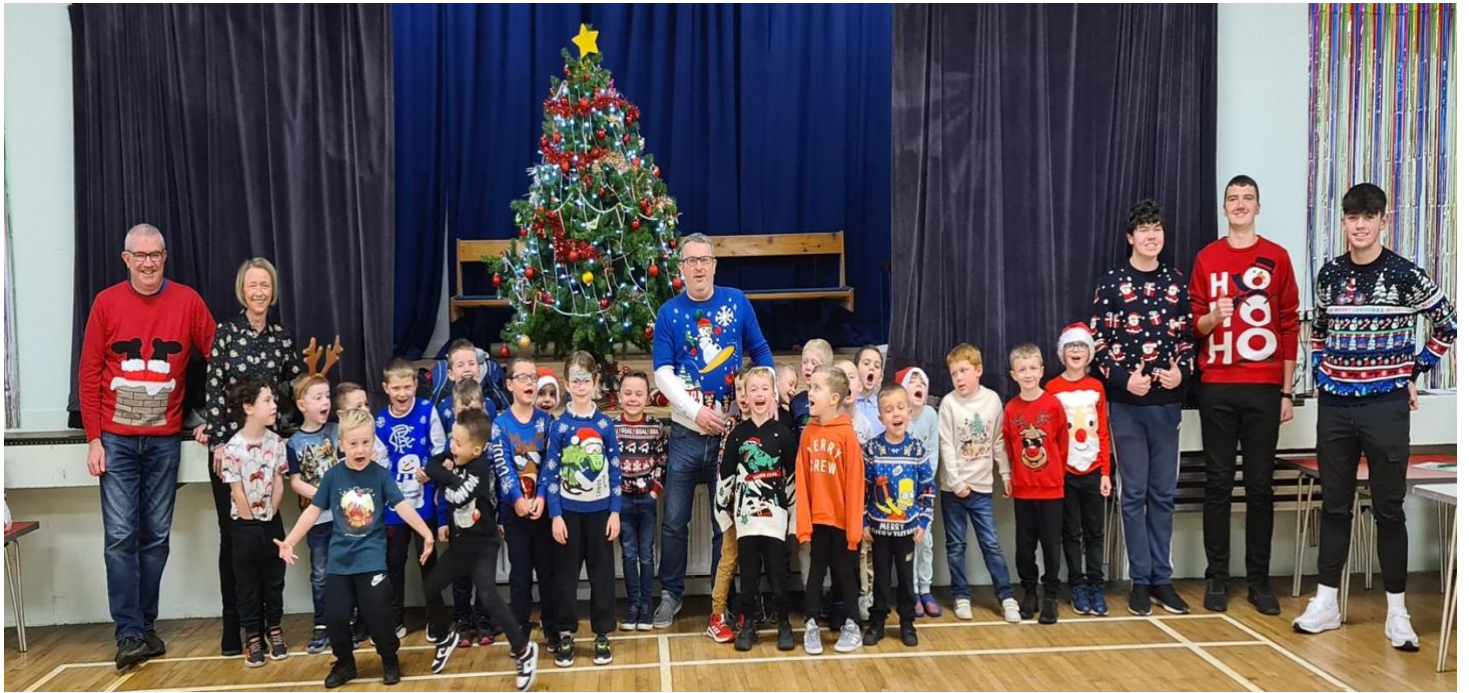
Photographs from the Anchor Boys' Christmas Party