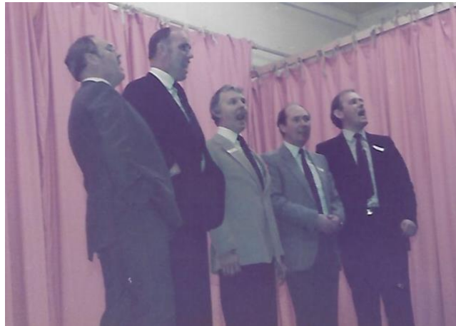
The Riversiders in full voice in the mid 1980s

The Riversiders have made occasional appearances at Company events over the years.